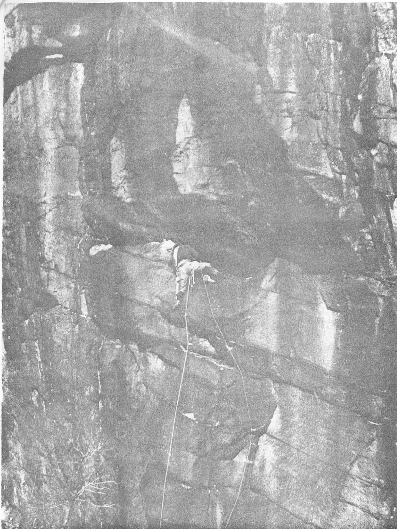
size to be approx. 17' x 12' (See Map). Pedestal - Heptonstall.